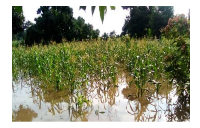
Figure 2: Flooded crops in Pochalla (August 2020)

In most of the affected areas, sorghum is the staple crop of the communities, and maize is a minor crop mostly grown around homesteads. However, maize is an important crop that fills the hunger gap until the long growing sorghum is harvested in early October. Therefore, the areas affected by early floods, especially when the maize crops were at vegetative stage are expected to go through the lean season without any respite from green maize harvest. On the other hand, in areas where the maize crop has already reached maturity stage, the impact of floods has been lower, despite the reduction of yield and spoilage of seeds caused by high humidity leading to fungal damage and rotting of the seeds. Although the sorghum crops that reached booting stage may survive the impact of flooding/ waterlogging, the productivity will be reduced due to the falling of the plants/stalks in the flood waters, and washing away of some fields planted closer to the river banks.